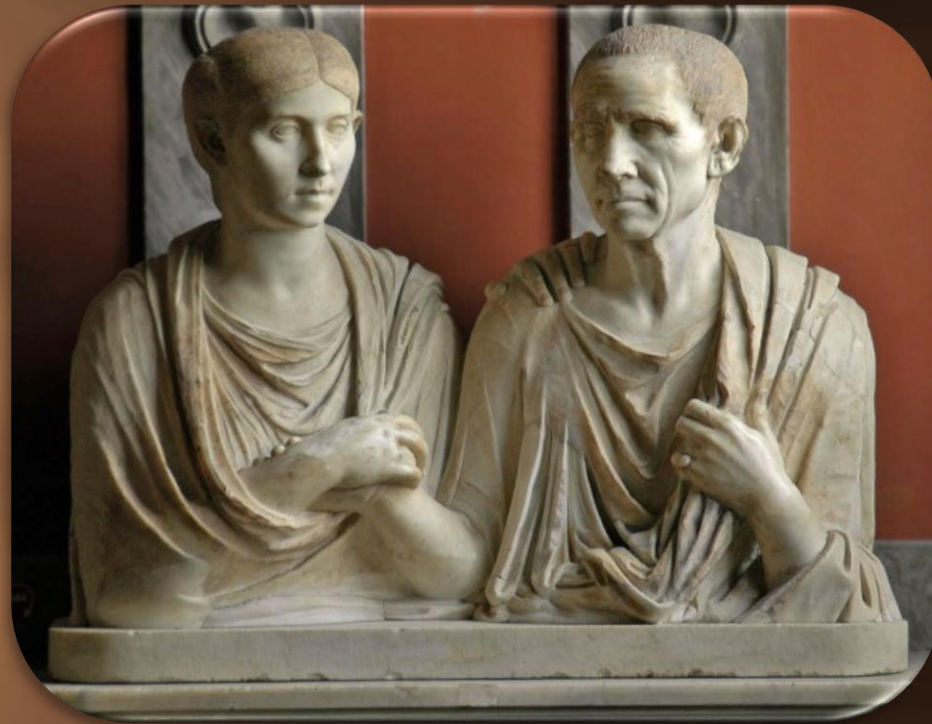
Aquila and Priscilla